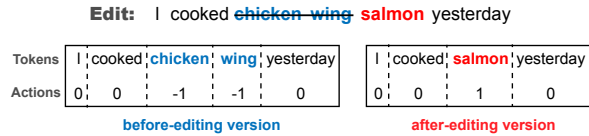
Figure 1: An example of the action encoding associated with changing the phrase “chicken wing” to “salmon”. Specifically, the values -1, 1 and 0 are used to represent deletions, additions and unchanged tokens, respectively.